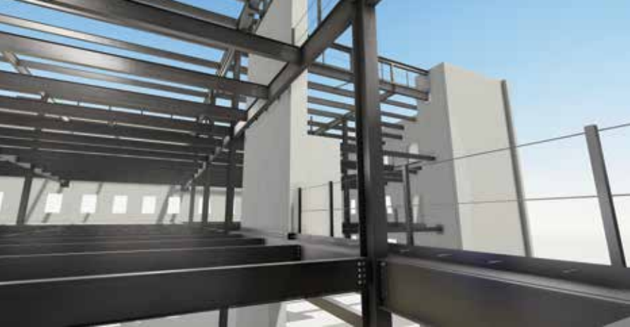
Multiple trades viewed the LOD400 model to ensure all interrelated structural components were designed internally and coordinated at a fabrication level to eliminate conflicts.