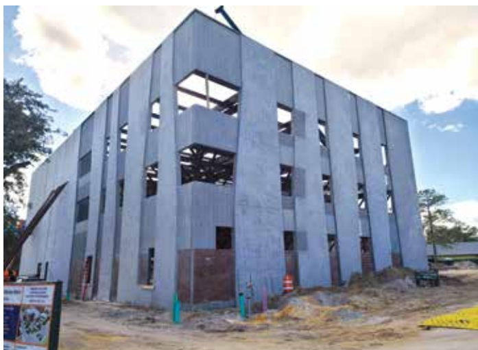
A unique component of the tilt wall design is the blend of architectural and structural design

On a typical construction project, concrete contractors earmark 7-10 percent waste for rebar and 10 percent for concrete in their bids. On the PSB project, no waste factor for rebar was needed because an accurate bill of materials was issued. This savings equated to more than 6 tons of rebar and over $14,000 in cost savings – simply by advancing the rebar to the LOD400 level (which is above and beyond current industry practice) and making no other changes to the project.