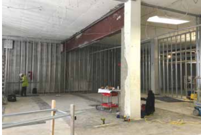
Two cast-in-place concrete columns were removed and replaced with new steel transfer beams as part of the Centrex Building reconstruction.