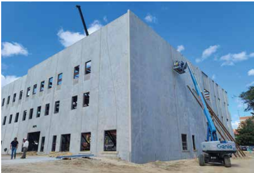
The University of Florida Public Safety Building is located in the middle of campus and constructed using tilt-up concrete wall panels for the exterior structure.