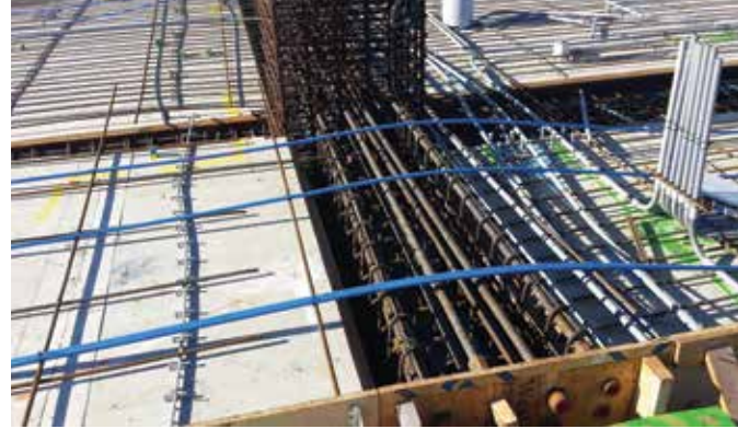
PT beam/column picture during construction.