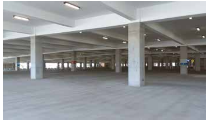
Soffit view of the typical floor framing.

minimal conflicts, and to limit the amount of unnecessary “throw-away” or “feel good” reinforcement that can inadvertently inflate the capacity of the horizontal framing elements and thus detrimentally affect strong column-weak beam behavior.