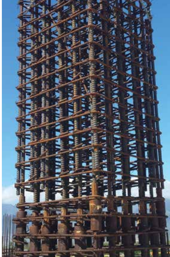
Moment frame column cage during construction

While smaller columns were sufficient for gravity design, the typical interior column size was increased to 36 inches square to improve ductile behavior, decrease the amount of reinforcement required, prevent the use of expensive #18 rebar, and alleviate congestion. All joints were designed to meet the joint shear limits of ACI 352R-02, Recommendations for Design of Beam-Column Connections in Monolithic Reinforced Concrete Structures , in place of the less stringent requirements of ACI 318. The design of the post-tensioned slabs, beams, and girders were all carefully coordinated to allow reinforcement and post-tensioning to be placed with