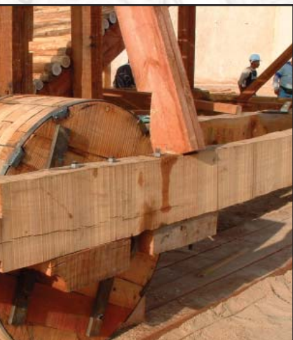
Figure 5: Both the wheel and the mortise and tenon joints used techniques that are rare today

Once the wheels were complete, the team moved on to the carriage portion of the tower, which comprised the lowest 12 feet of the structure (Figure 4). Because eucalyptus is stronger and more dense than pine, we constructed the entire carriage using this material. The higher strength was important because the loads from the upper floors would be carried down to these members. The density of eucalyptus also gave us an advantage by shifting the center of gravity lower. We used mortise and tenon joints on portions of the carriage, and tied the joints together by driving hot stakes through them. Figure 5 shows both the details of a completed wheel, as well as a classical mortise and tenon joint.