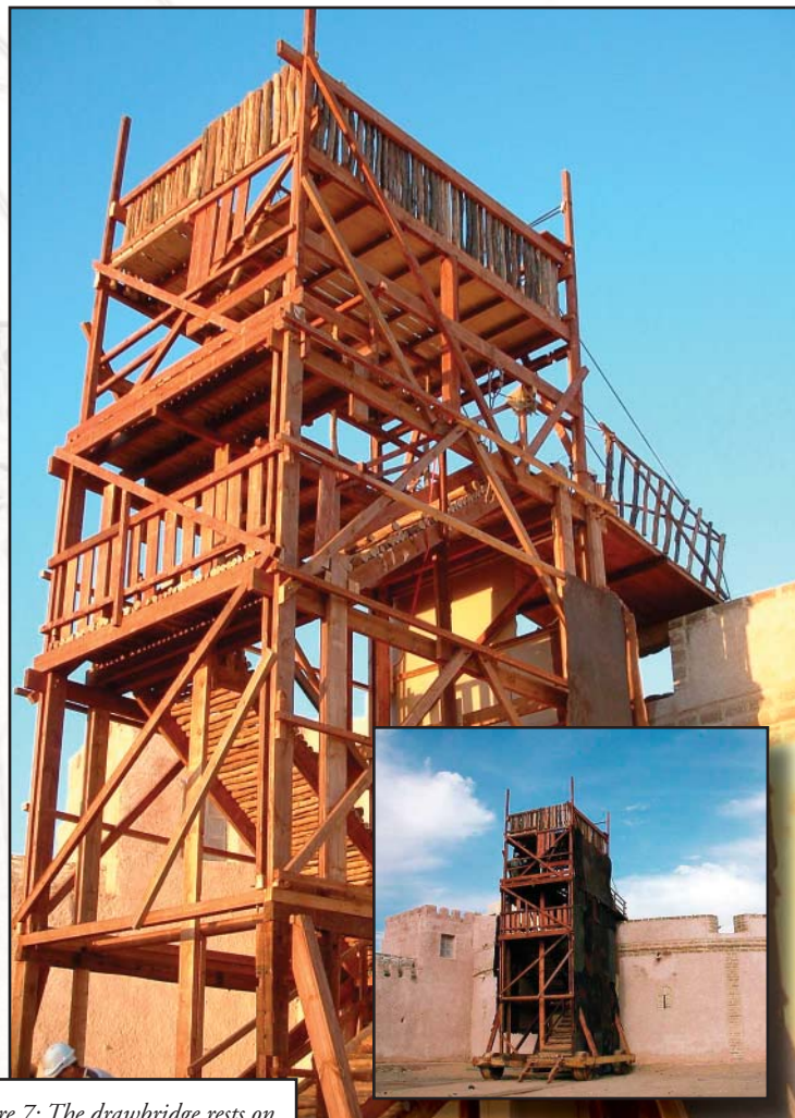
Figure 7: The drawbridge rests on the wall after a successful attack