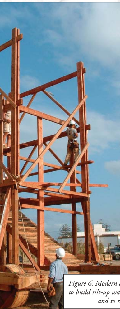
Figure 6: Modern construction techniques were used to build tilt-up walls for the second and third floors, and to raise them into position

The final step for completing the tower was adding ramps between floors. We first thought that ladders would be the easiest way to reach the drawbridge and attack floors of the tower. However, when thinking of troops carrying armor and trying to move quickly through the tower, a ladder did not seem very logical. Our second thought was to use stairs, but they would be very steep due to our predetermined tower dimensions. We eventually decided to use ramps. They were easy to use, fast to construct, and accessible to more troops, plus we could frame them with stringers for added support.