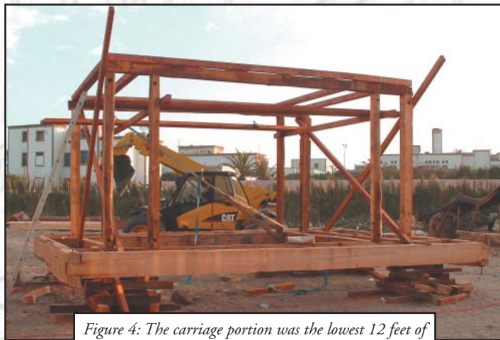
Figure 4: The carriage portion was the lowest 12 feet of the tower and was constructed with classical joinery

The use of a siege tower was first recorded in the Battle of Motya in 394 B.C. Dionysius I led his Greek army, consisting of tens of thousands of men, from Syracuse on the east coast of the island of Sicily. Motya, an island off of the west coast of Sicily, was once the homeland of Dionysius I. However, Motya was taken over by Carthaginians and Dionysius I was determined to get it back. Dionysius I gathered all of his leading mathematicians, scientists, and inventors to create the most powerful weapons of the day. While we may take brainstorming for granted, it was Dionysius I who strategically used it to his advantage. This brainstorming session not only brought about the creation of the first high-powered catapult and belly bow, but also the first siege tower.