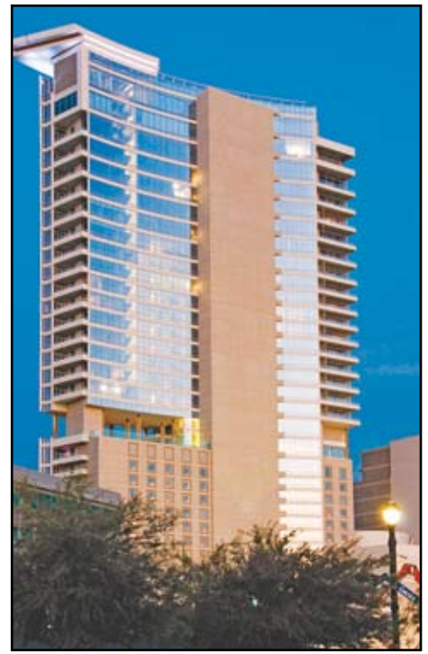
Completed structure with monostrand and bonded multi-strand systems.

Post-tensioning has seen much development and many improvements over the past 50 years, resulting in the method now serving as a significant feature in mainstream construction. The next article in this series will review the contemporary uses of post-tensioning in building construction and how it can successfully be incorporated into a project design. ■