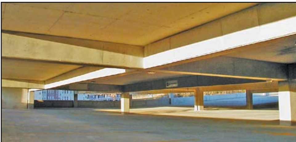
Bonded parking structure.

An example of an owner choosing bonded post-tensioning for the method's life-cycle savings is the Baltimore Washington International Airport Consolidated Rental Facility. The bonded post-tensioning system used in this structure provides total encapsulation of the strands using PT Plus™ plastic duct with watertight mechanical duct to anchorage couplers. The rental facility was completed in December 2003, and includes over one million square feet of elevated, post-tensioned, cast-in-place concrete. ( www.structural.net/News/Media_coverage/ci2505loper.pdf )