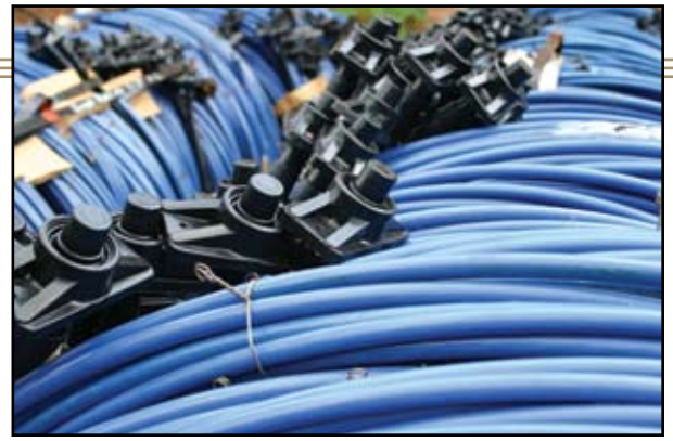
Monostrand tendons coiled, labeled and ready for shipment.

Bonded post-tensioning systems are comprised of tendons from one to multiple strands (multi-strand) or bars. For bonded systems, the prestressing steel is encased in a corrugated metal or plastic duct. After the tendon is stressed, cementitious grout is injected into the duct to bond it to the surrounding concrete. In addition, the grout creates an alkaline environment which provides corrosion protection for the prestressing steel. An advanced duct system, PT-Plus™, encases the prestressing steel in a corrugated duct and plastic coupler system.