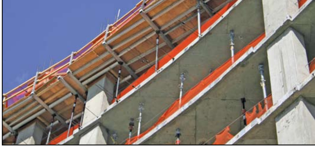
Flat plate slab construction using unbonded post-tensioning.