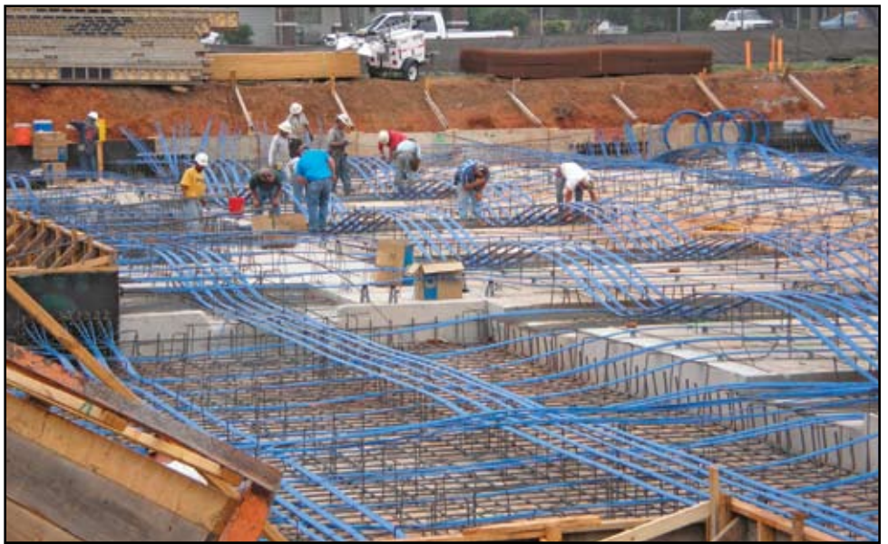
Mat foundation construction using monostrand tendons.

Post-tensioned structures offer numerous advantages. These include reduced dead load and member depth because of the decreased amount of concrete required. There is also increased deflection control and greater crack control. The improved crack control also improves durability. In addition to these advantages, post-tensioning allows for in-