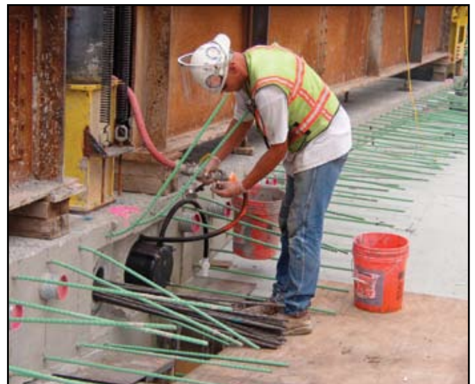
Bonded multi-strand grouting.

Tendons placed in the formwork prior to pouring the concrete are known as internal tendons. Most post-tensioning applications use internal tendons. In external applications, tendons are installed outside of the structural member. The system consists of prestressing steel, mechanical end anchorage devices and a corrosion protection system. External systems are generally installed in