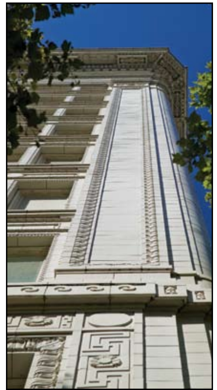
Original terra cotta façade.

Another design consideration was the building's exterior terra cotta facade. The preservation of the facade required an in-depth investigation into the condition of the terra cotta and its anchorage to the building's structural elements, including review of existing shop drawings from the original construction. The viscous damper system reduced the earthquake