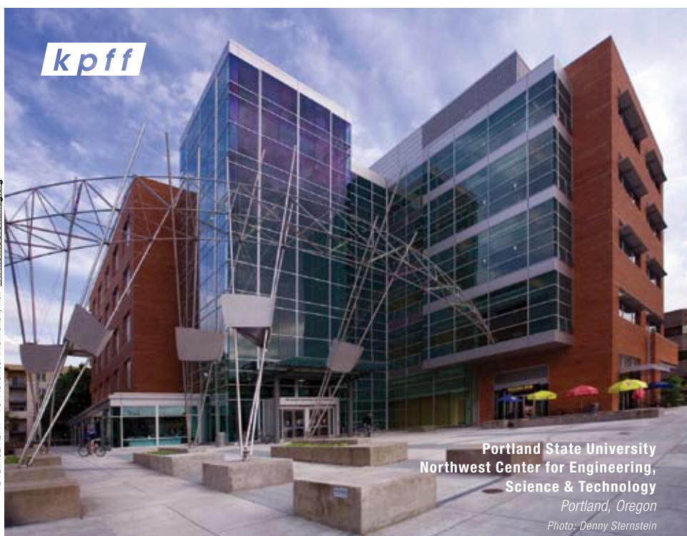
Portland State University Northwest Center for Engineering, Science & Technology Portland, Oregon