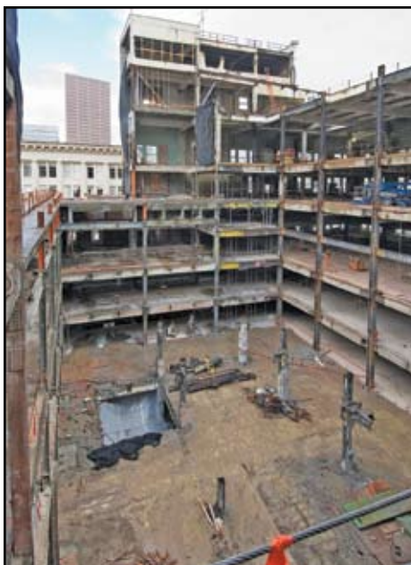
Interior demolition of upper floors creates a new hotel atrium.

Obtaining the right geotechnical data was essential and two firms, GeoDesign and URS, joined forces to provide the ground motion input. The period of the existing structure was unusually long, and it was necessary to develop pertinent data for the long-period range of the response spectrum. The long-period transition period, T_L , was found in the 2003 NEHRP Provisions (now in ASCE 7-05) as 16 seconds for the Portland area, which was much greater than the building period. If the FEMA 356 General Response Spectrum was used explicitly for the site-specific study, it would have resulted in unrealistically high accelerations for the long