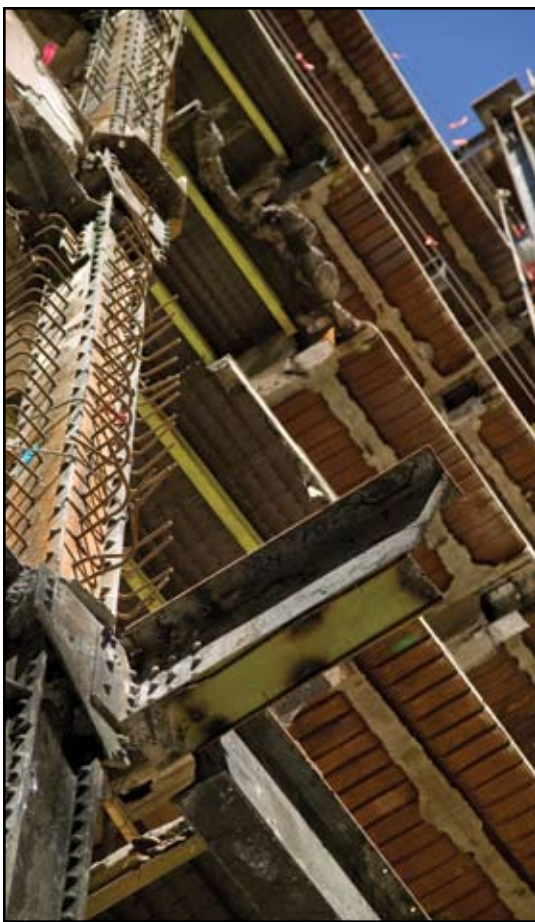
Dowels installed on existing columns for concrete retrofit.

behavior of the building. To comply with FEMA 356, the non-linear properties of the existing joints needed to be determined by experiment. After reviewing multiple research studies, the design team selected experiments performed at the University of Washington as the most representative.