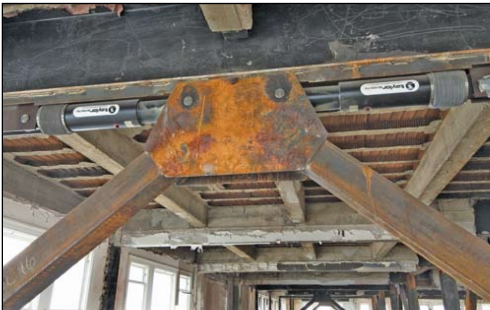
Close-up view of installed damper frame.

The damper units are comprised mainly of a large cylinder with a piston. One end of the damper unit is connected to the adjacent floor, and the other end to the brace assembly that connects to the floor below. As