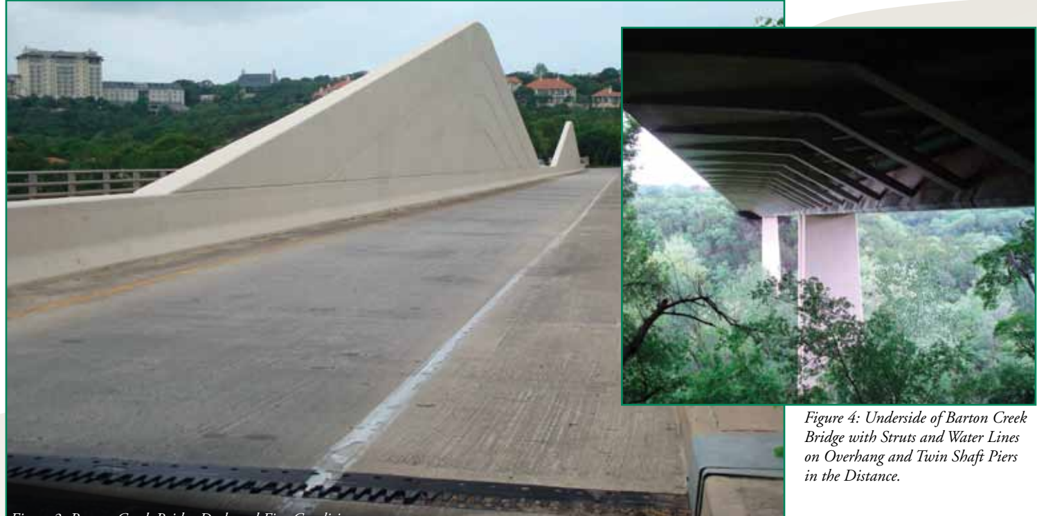
Figure 3: Barton Creek Bridge Deck and Fins Condition.

situation, a high strength post-tensioning bar was added to a beam/ parapet at the exterior edges of the deck. This progressively coupled bar was stressed following casting of each segment.