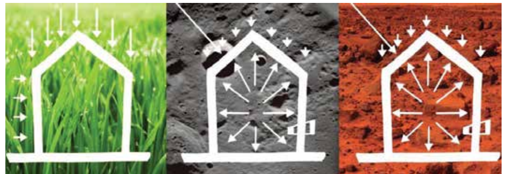
Loading on the Earth, the Moon, and Mars.

Structural systems for space habitats must be designed for four main loading types: internal pressure, reduced gravity (one-sixth on the Moon and