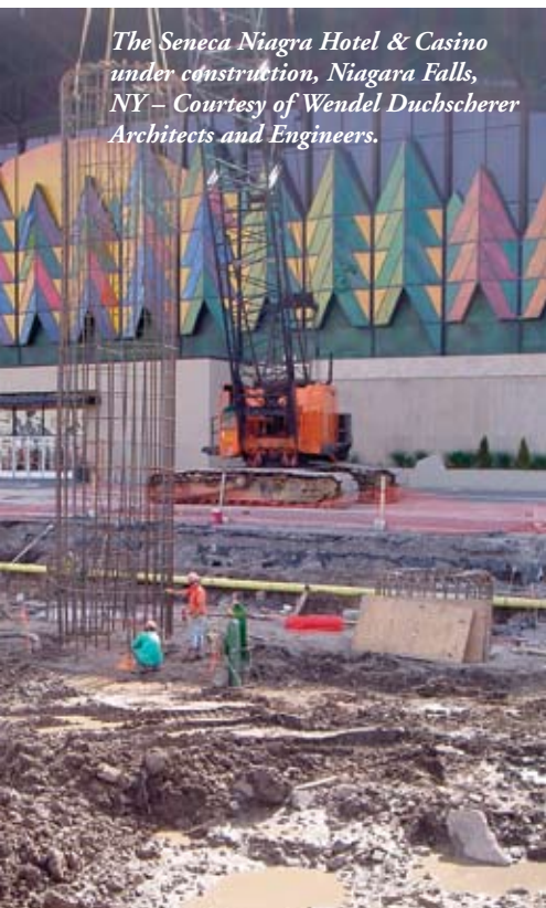
The Seneca Niagara Hotel & Casino under construction, Niagara Falls, NY – Courtesy of Wendel DuChscherer Architects and Engineers.