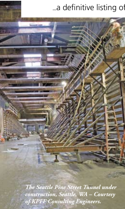
The Seattle Pine Street Tunnel under construction, Seattle, WA

...a definitive listing of specialty construction firms and product manufacturers/distributors