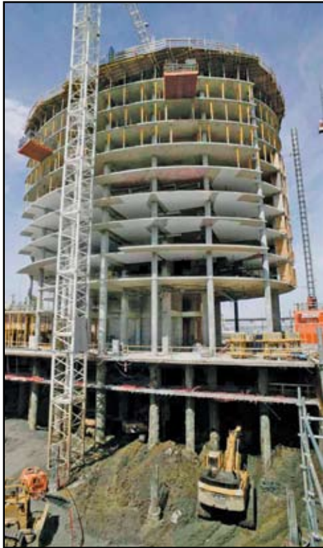
Figure 3: The excavation continues straight down to P3, without forming P2, to offer the contractor maximum available head height.

The sheet pile segments are 24 inches long and 18 inches deep, and were installed in pre-welded, 4-foot long pairs. With three-quarter-inch thick flanges and one-half-inch thick webs made from A572 Grade 50 steel, the piles are strong enough to absorb the energy of driving them through dense gravelly soils to tip elevations that may be 50 feet or more below the surface. Interlocking ends allow the piles to be driven separately while maintaining good alignment with one another. Seal welding the sheets at their joints creates a watertight structure. The heavy sheet piles do not require a separate foundation system to support them and their tributary floor loads. They carry axial loads through the skin friction on their sides and end bearing.