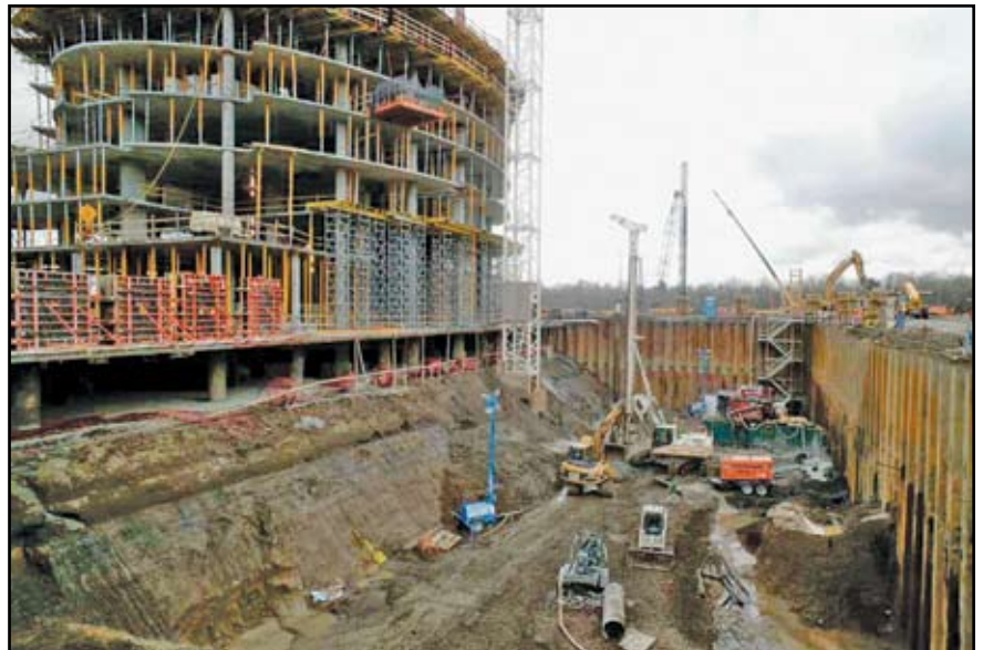
Figure 2: The conventional excavations portion of the site was used to facilitate up-down excavation under the tower.

Embedded into dense cemented gravels that underlay the city, the shafts achieved very high tip bearing pressures. A 3-foot