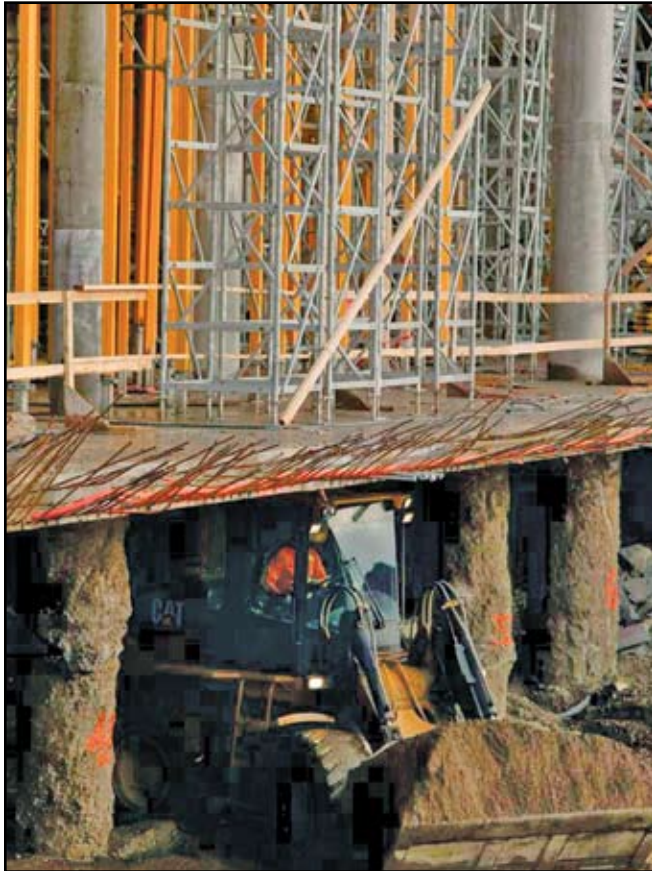
Figure 1: Excavation proceeds down to the P1 level while ground construction begins.