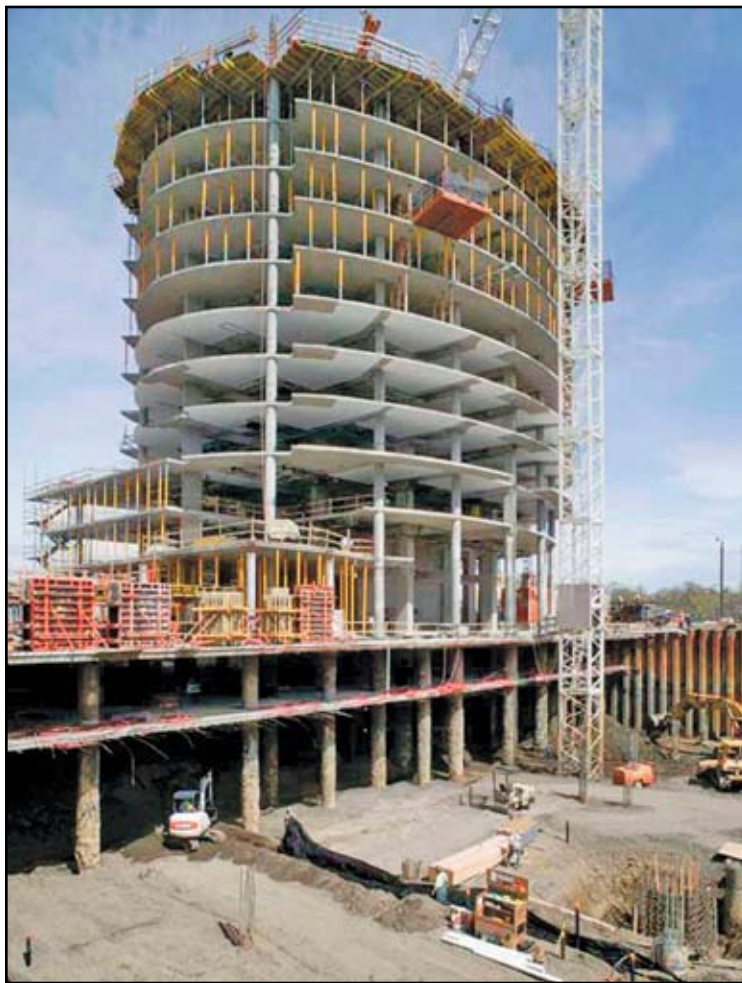
Figure 4: Excavation bottoms out below the tower at P3. The bottom slab is now ready to be poured, and the P2 slab can be poured and formed conventionally.

The contractor attached the below-grade floors to the shafts using epoxy dowels drilled into the perimeter of the roughened shaft. The appearance of the shafts will be softened by encasing them in an architectural wrap. Another option is to leave the steel pipe casing used to support the augured hole in place for the future exposed height of the shaft. The casing can be cleaned and painted as needed after the excavation. The slabs can be supported directly by the casing by welded ledger an-