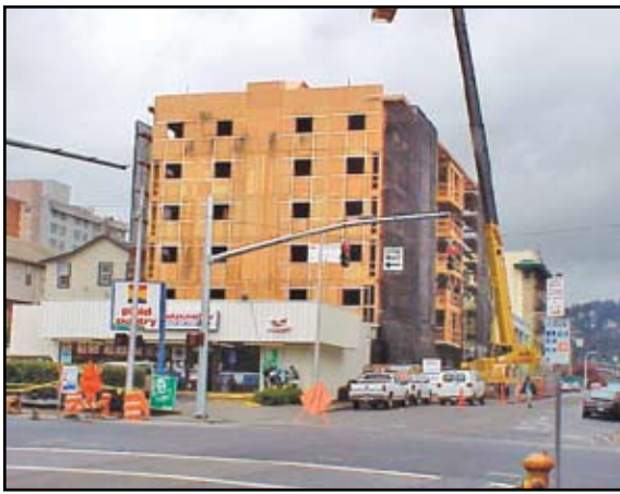
Figure 2: Perforated Shear Wall Elevation