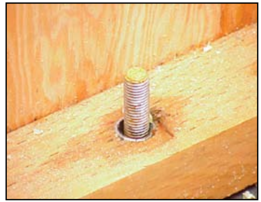
Figure 5: Wall Sill Plate to Steel Anchor Plate Connection

The Cornerstone Condominium Building consists of five-stories of wood framed structure above a one-story concrete structure. The structural design and performance of high rise wood frame buildings require attention to issues that are usually not of great concern for the typical wood frame building less than four stories. Unique solutions are required to address issues such as the high vertical load demands on the wood stud framing, the transfer of shear wall loads and wood shrinkage. ■