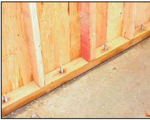
Figure 4: Wall Sill Plate to Steel Anchor Plate Connection