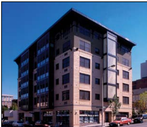
Figure 1: Cornerstone Condominiums

Currently, to the best of the author's knowledge, the only two municipalities in the United States that allow five-story wood frame buildings are Seattle, Washington and Portland, Oregon. Over the past 10 years there have been several high rise wood frame buildings constructed in the City of Portland, of which Cornerstone Condominiums is one.