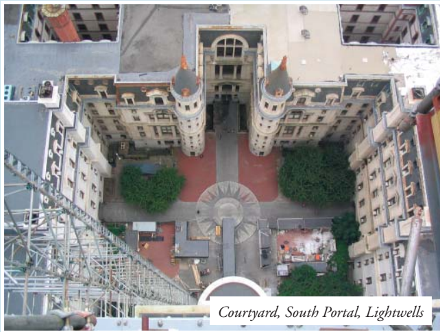
Courtyard, South Portal, Lightwells