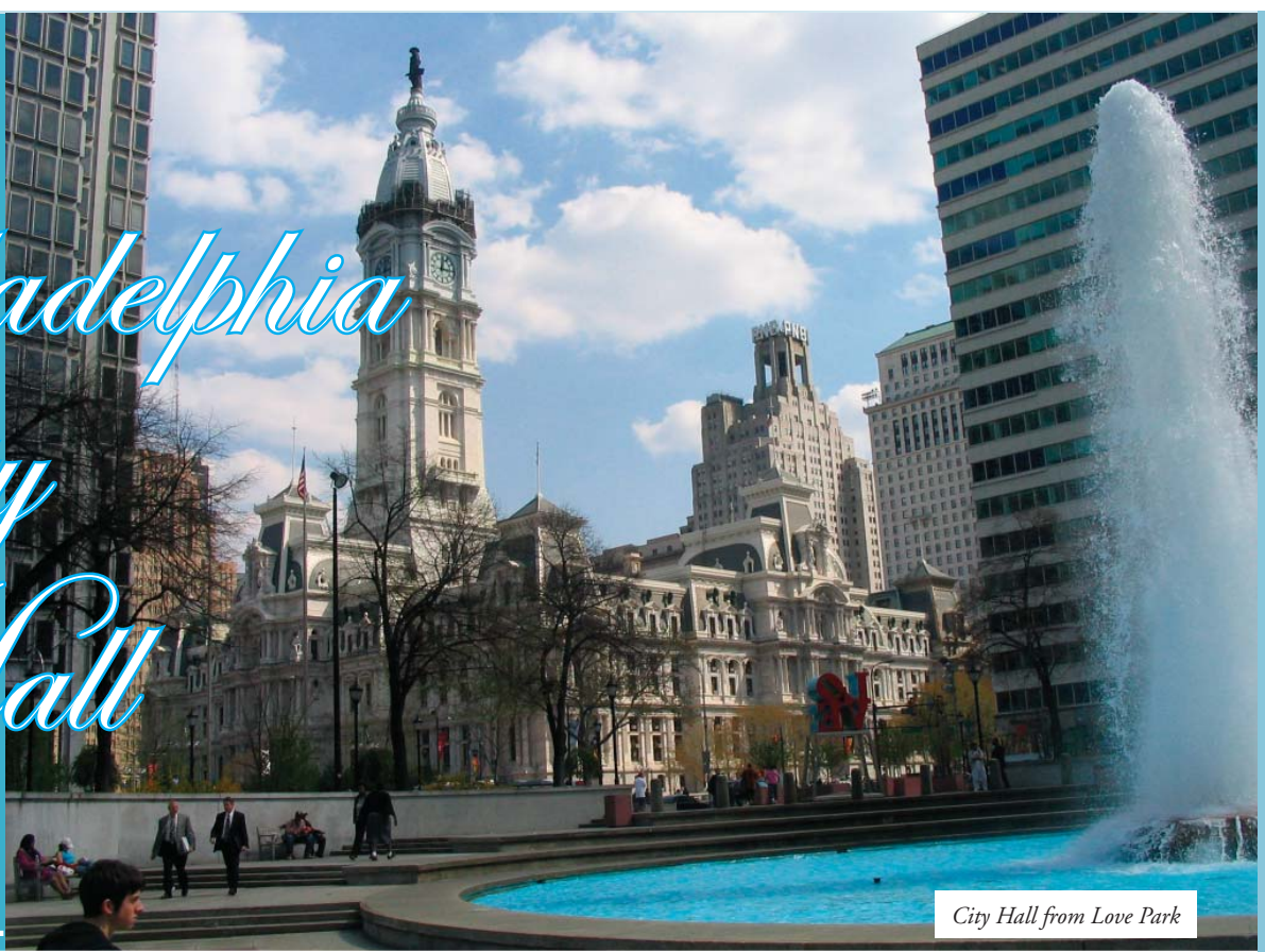
City Hall from Love Park