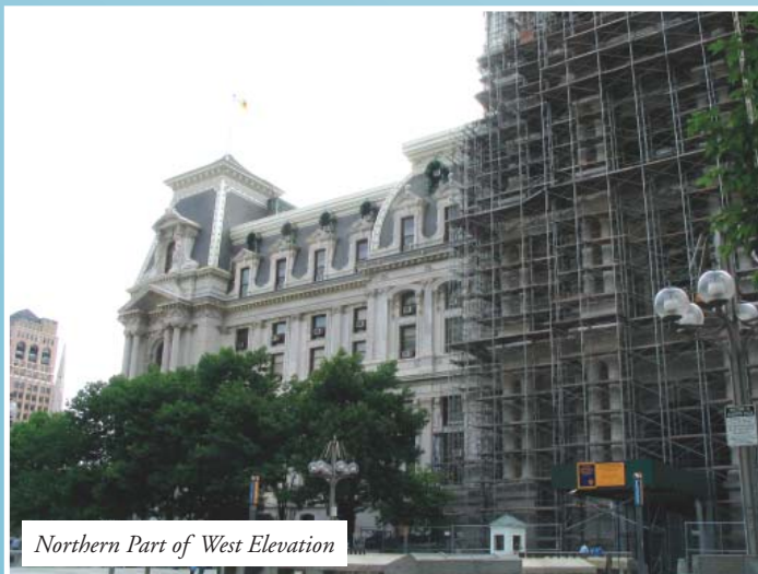
Northern Part of West Elevation

The original illumination was gas, and many gas pipes and wall escutcheons remain. With the advent of electric power, a change was made to direct current generated on site in a dynamo room and its boiler room under the Courtyard. Five years were required to chase the