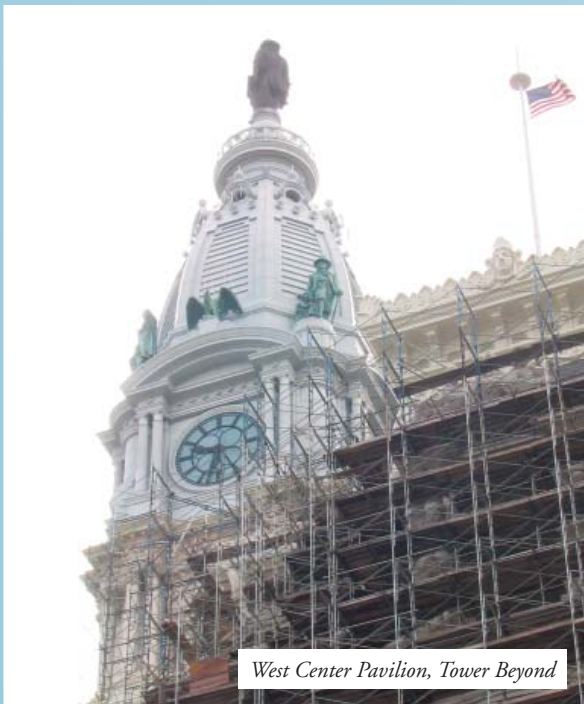
West Center Pavilion, Tower Beyond

Phase 2 included the west face of the Northwest Corner Pavilion, north curtain, north wing, and the West Center Pavilion, with an accepted alternate for the south wing and south curtain. Phases 3, 4 and 5 from the Southwest Corner Pavilion around to the East Center Pavilion have been documented as one Phase 3, separated as parts A, B and C. Phase 6 will cover the south side of the courtyard and, possibly, the two light wells.