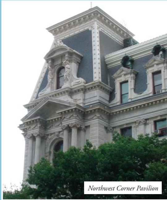
Northwest Corner Pavilion

mechanical/electrical, and air conditioners. The scope of work was established by the design team and representatives of the City. Specifications were prepared in the Masterspec format.