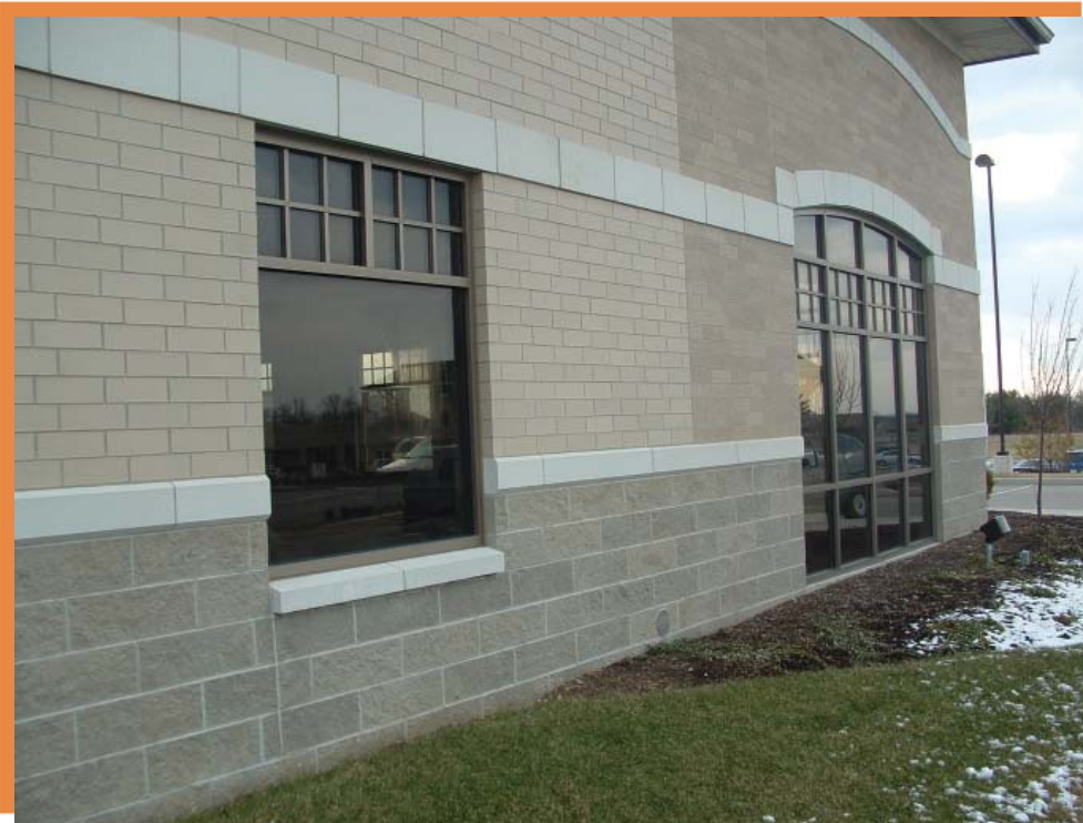
This building has a wainscot of six courses of 8 x 24-inch cast stone, 8-inch high accent bands at the top of the wainscot and near the top of the wall, and a 12-inch high accent band above the windows. A control joint was installed below the window after cracks appeared at a number of windows. It should be noted that nearly all of the head joints in the accent band over the window have hairline cracks, but they were not noticed by the Owner.

The National Concrete Masonry Association (NCMA) has a number of TEK Guides that address these issues: TEK 5-2A Clay and Concrete Masonry Banding Details and TEK