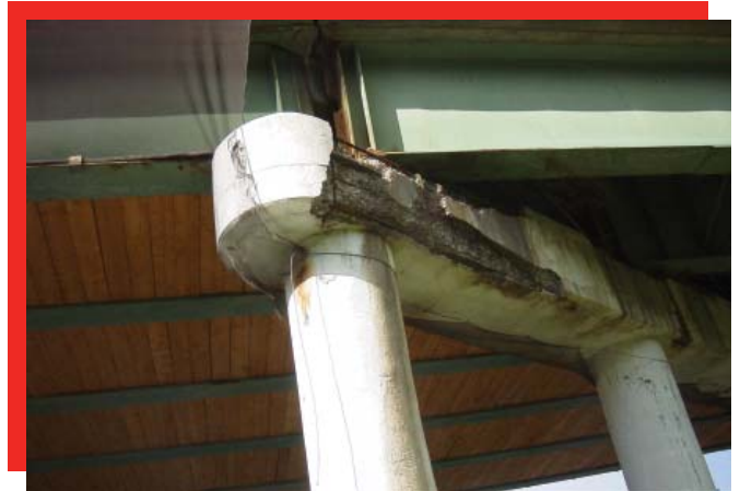
Figure 1a: Typical Corrosion problems: Bent Cap

Testing at UMass compared 14 different mix designs using macrocell, half-cell potentials, and visual evaluations. Mix designs included combinations of up to 3 admixtures (pozzolonic materials, corrosion inhibitor, DSS). Concrete containing DSS as the only admixture showed minimal corrosion activity through 186 weeks of testing. Only a triple combination of Calcium Nitrite, Silica Fume and Fly Ash equaled this