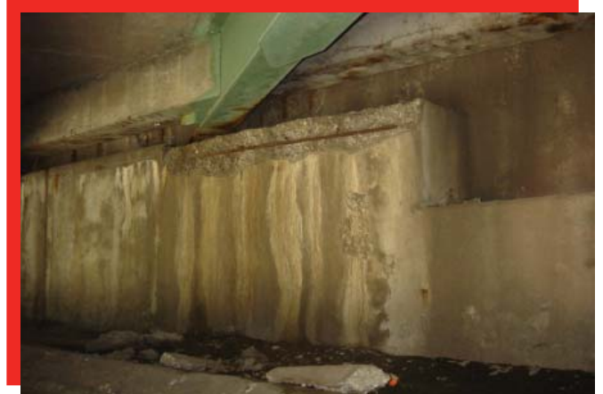
Figure 1c: Typical Corrosion problems: Abutment Wall

performance. The Calcium Nitrite specimen showed corrosion activity at 170 weeks. Linear polarization techniques and visual examinations were used in testing at UConn. DSS was included in specimens at 1 or 2 percent by weight of cement. After 48