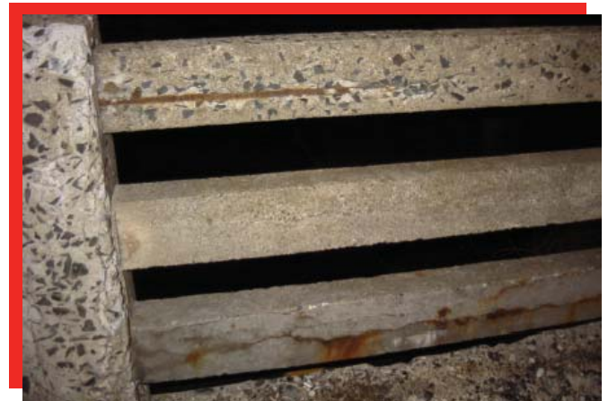
Figure 1b: Typical Corrosion problems: Guardrail