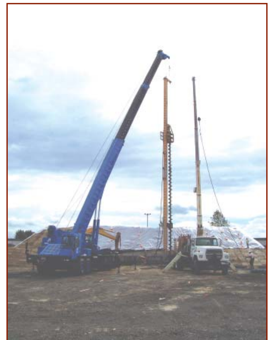
Figure 1: Crane with Drill Leads

Augercast piles can be used in low over-head clearance conditions by adding and then removing segments of auger during drilling. To help ensure continuity of the grouted hole during this process, it is typical (and required by IBC 1810.3.3) to re-drill and grout at least 5 feet every time a segment of auger is removed since the process involves arresting grouting to remove the auger segments. The minimum head clearance required will depend on the specific drilling equipment; however, some contractors claim that augercast piles can be installed in less than 10 feet of head clearance.