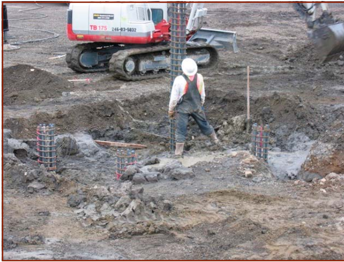
Figure 2: Reinforcement cage being lowered into a grouted hole