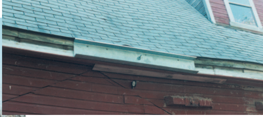
Stiffening channel at Eave 1

benefit, the barn could be returned to a vertical position, also over a number of years. Certainly the return of the barn to its original position could be accomplished in a more efficient fashion than it had taken Mother Nature to displace the barn initially. Thus the concept of controlled tensioning was born.