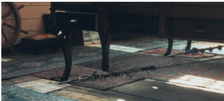
Cables passing through floor