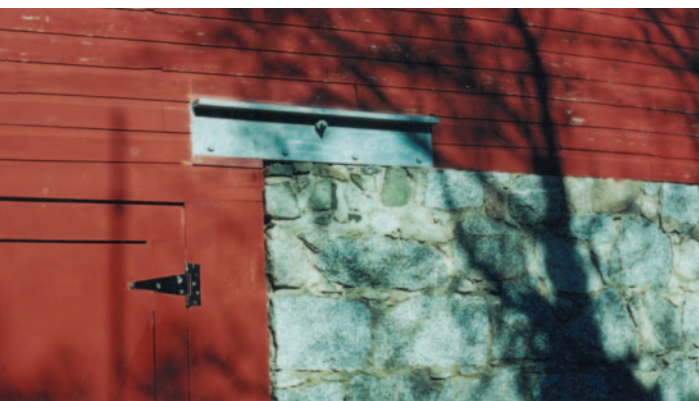
Load distribution angle at first floor