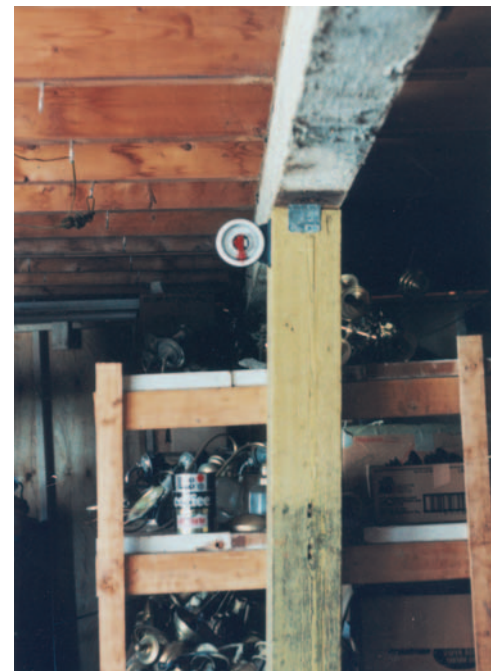
Inclinometer on wood column

With everything in place, the tensioning started and the rest is history. Over a period of five years, the structure was "righted". Not unexpectedly, tensioning over time revealed the stiffness differences of the structure. This required slight adjustment to the sequence