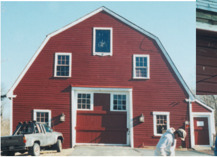
Front elevation at completion of "righting"