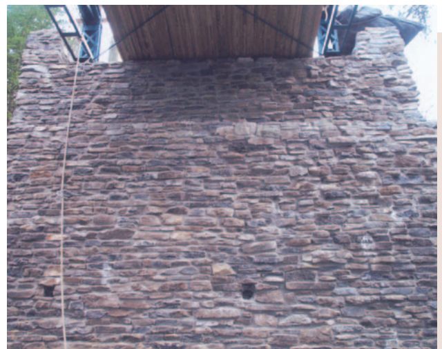
South abutment using stone from the arch bridge

Based upon the inspection, it was clear that the bridge was in excellent condition and could be restored without significant expense. An estimate and preliminary plan for was prepared for consideration by the Town of Malta. The writer, as a representative of Clough, Harbour & Associates LLP (CHA) of Albany, NY, approached the Town Supervisor and proposed the use of the Washington County bridge at the stone arch location, stressing the