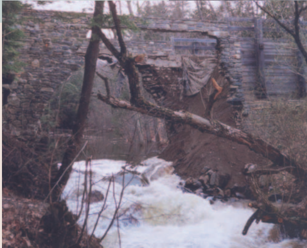
Malta stone arch, collapsed April 1993