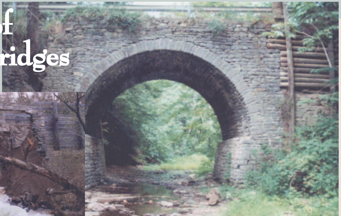
Malta stone arch bridge before collapse