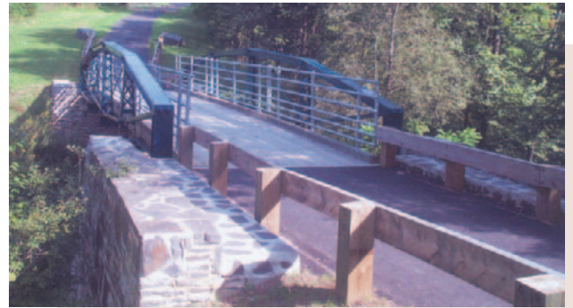
Bridge at Malta, August 2003

Work began in October 2001. A mild, snow free fall and early winter enabled the contractor to finish the bridge by Christmas of the same year, with the exception of site work and railing which were completed in the spring of 2002. The bridge was dedicated in the fall of the same year.