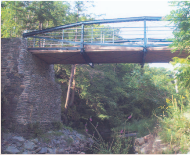
Bridge at Malta, August 2003

replacement of a historic structure with a historic structure providing a crossing for pedestrians and bicycles at a reasonable cost. The SHPO was supportive of the project and indicated that the bridge at its new site would also be eligible for the National Register. After several public hearings, the project was approved and CHA was retained to prepare a TEA 21 (Transportation Equity Act for the 21st Century) proposal. The proposal was then submitted, with the Town committing to cover 20% of the project.