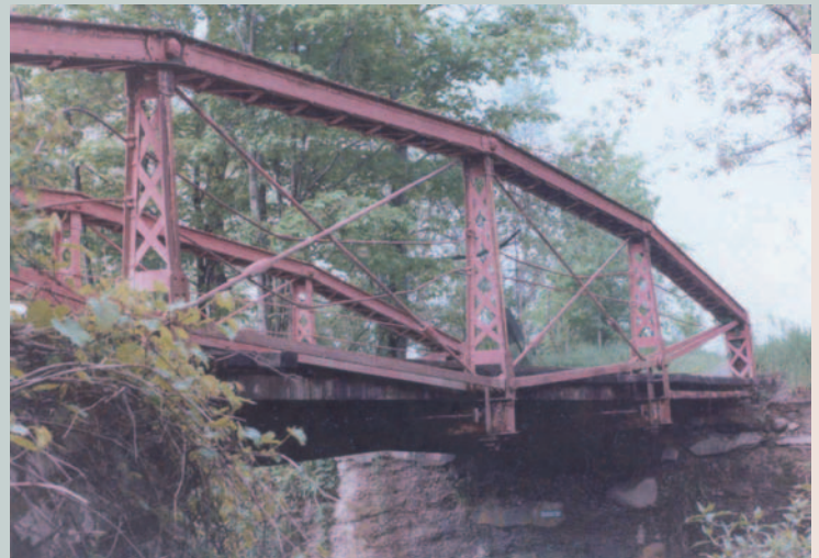
Berlin Iron Bridge, Salem, Washington County, NY

Due to the low volume of traffic, the Salem bridge served well for over 100 years, only requiring wood deck replacement periodically. The State Historic Preservation Officer (SHPO) determined the bridge was eligible for future placement on the National Register of Historic Places. State inspections in the 1980s indicated section losses on the steel stringers of up to 30% and on some of the truss elements up to 20%. The abutment stonework was also collapsing in places. The bridge was flagged at the time and its load rating reduced. In 1990, the county decided to remove the bridge with the intention of restoring and re-erecting it at another location. The bridge was moved to the County Park near Cambridge, where it was cleaned and painted by inmates from Mt. McGregor Correctional Facility. In the spring of 1998, the County was still planning to use the bridge, but by early 1999 the Supervisors instructed the County Engineer to find a new home for it. At this time, the writer was asked to assist in finding a town, county or individual interested in a bridge of this span.