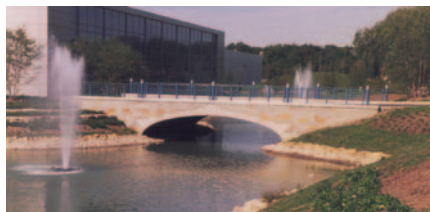
LTD Commodities, Lake County, IL