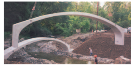
First 42-foot span installed; Savage Road, Erie County, NY

The CON/SPAN shape develops an efficient arch action in the top of the unit by reacting on the adjacent soil mass along both sides. The structural action creates