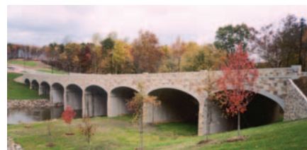
Largest installation to date (9 cell structure crosses 446-feet of the Goose Creek); Coton Bridge, Loudoun County, VA

Patents were applied for and issued for the technology. Introducing new technology and a proprietary product is a slow process. Since there is no Federal Highway approval process, the product approval for state project use had to be state-by-state. Gaining acceptance of a new technology – the soil structure interaction concept – required load testing. Working with a Columbus, Ohio precast producer, the first full-scale load test of a CON/SPAN structure for the