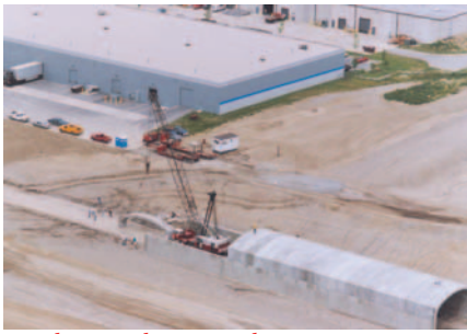
Roadway underpass under airport taxiway.

anchored wingwalls that allowed an entire bridge to be set in hours and backfilled immediately.