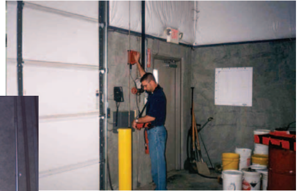
Hilti FS10 in use.