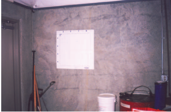
Tilt-up concrete wall panel with grid paper for use with Hilti Ferroskan FS10

Article Note: Opinions expressed in this article are those of the author and may, or may not, reflect the opinion of STRUCTURE magazine.