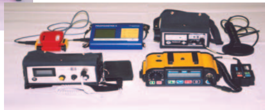
Clockwise from top left: Proceq Profometer 5, Protovale Rebar Plus, Protovale Covermaster CM9, Protovale

rough concrete surfaces, the meter readings occasionally spiked due to the movement of the meter, not due to reinforcing. Using the charts included in the manual, it was possible to determine the bar covers and diameters. This was accomplished by using the difference in two meter readings: one with the meter directly on the concrete surface and one with the meter off the surface by a certain shim distance. However, in addition to the meter readings, the accuracy of this measurement was closely related to the ability of the user to properly calibrate the meter. In order to calibrate the meter, it was necessary to hold it at the same attitude (angle to the earth's surface) that the meter would be in at the concrete surface and also parallel to