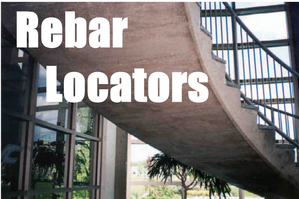
Curved stair constructed with cast-in-place concrete