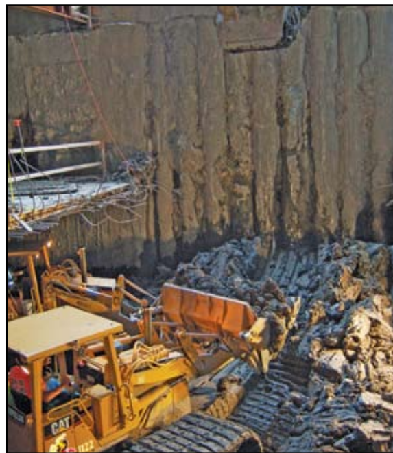
Small track-mounted loaders push soft clay from below the B1 slab level while a long-boom backhoe removes the soil from the glory hole on the south side of the site at the secant pile wall.

With the deep excavation required to build the four basement levels, top-down construction using permanent earth retention systems would be more rigid than traditional temporary cross-lot bracing and open-basement construction methods. Placement of the secant pile and slurry