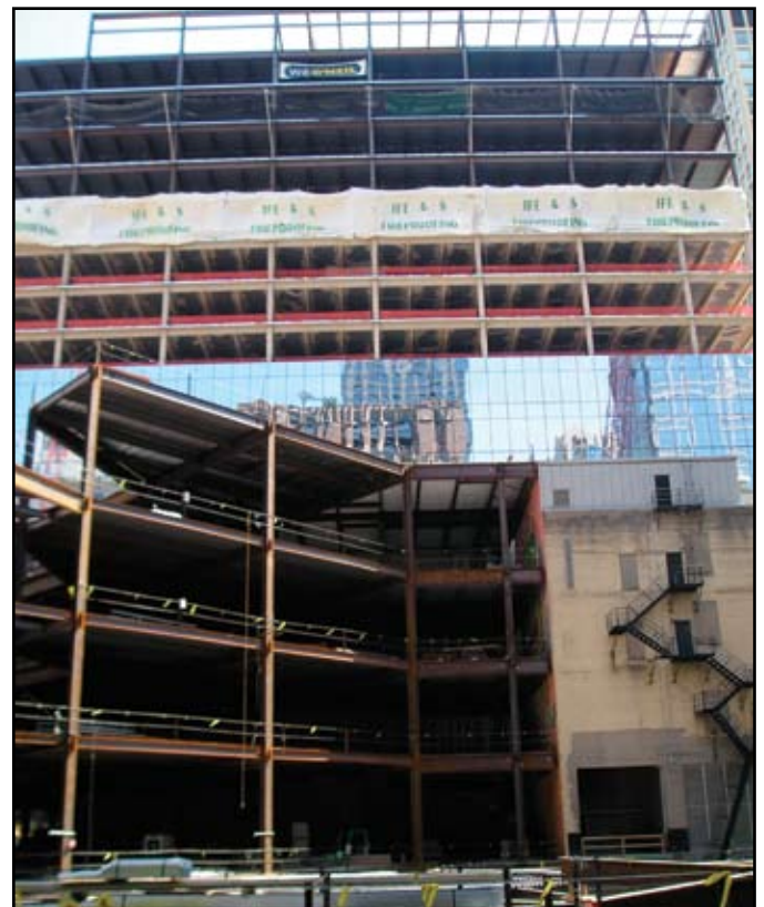
Retail steel framing is erected alongside existing operational ComEd building while the Media Tower situated in the background awaits remaining curtain wall.