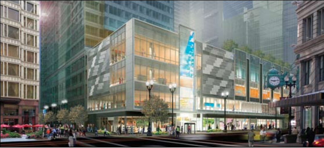
Schematic of the Future 108 N. State Building.

was constructed. Many components of the original Stop and Shop foundation were reused, including existing hand-dug rock caissons and portions of the existing perimeter basement wall. New caissons were sized so that the shafts of belled caissons could work as straight shaft rock caissons if obstructions from the existing building were encountered during construction. An Osterberg load cell test, a full scale caisson load test, was performed at the base of a new production top of dolomite bedrock rock caisson to increase the rock bearing pressure the Chicago code allowed from 50 tons per square foot (tsf) to 90 tsf. The former Stop and Shop structure also included large grade beams, consisting of steel beams encased in concrete, which had to be either removed or designed around. For the southernmost column line of the Media Tower site, where a deep excavation was not allowed to remove these grade beams to limit the street movements, four column foundations were redesigned during construction from one rock caisson per column to six rock-supported 390-kip-capacity micropiles per column.